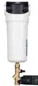
AUTO DRAIN OPTION