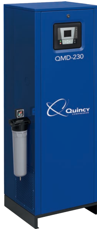
QMD Absorption Dryer

Compressed air enters through the coalescing filter, removing harmful particles and oil carryover that could damage the dryer and downstream equipment. Next, the air passes over the desiccant beads in the adsorption tower, removing moisture and bring the dewpoint down to -40°F. At the same time, the adjacent tower is regenerating its desiccant beads to be used again for adsorbing moisture. Regeneration is accomplished by passing a portion of dry air from the adsorption tower over the desiccant beads in the regeneration tower. This portion of air is known as purge air and is passed out of the dryer by way of the silencer. After the towers are done adsorbing and regenerating, they switch by way of the new innovative 3/2 solenoid switching valves, switching duties. The drier air is now passed through a particulate filter to prevent any desiccant dust or remaining particulate from reaching the downstream equipment.