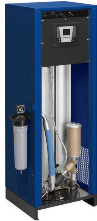
QMD Desiccant Dryer