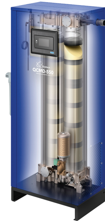
QCMD Desiccant Dryer