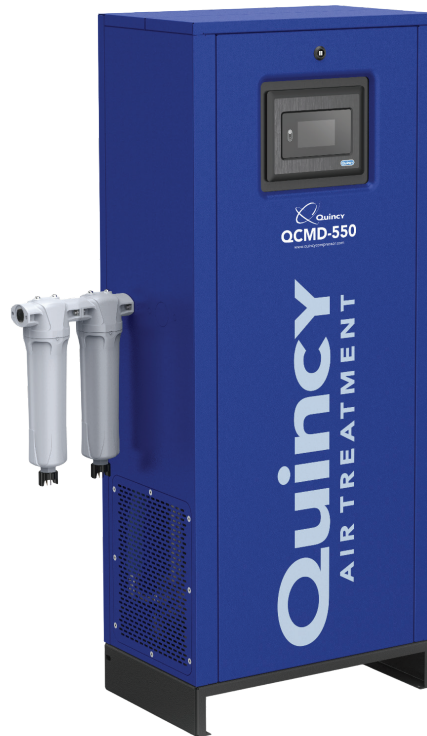
QCMD Absorption Dryer

Compressed air enters through both coalescing pre filters, removing harmful particles and oil carryover that could damage the dryer and downstream equipment. Next, the air passes over the ceramic desiccant blocks in the adsorption tower, removing moisture and bring the dewpoint down to -40°F. At the same time, the adjacent tower is regenerating its desiccant to be used again for adsorbing moisture. Regeneration is accomplished by passing a portion of dry air from the adsorption tower over the desiccant in the regeneration tower. This portion of air is known as purge air and is passed out of the dryer by way of the silencer. After the towers are done adsorbing and regenerating, they switch by way of the new innovative 3/2 solenoid switching valves, switching duties. To increase energy savings and dryer efficiency, the QCMD is equipped standard with dewpoint demand. The included sensors drastically reduce energy bills by only purging as needed instead of on a timed system. The dry air finally exits the dryer and moves on towards the downstream equipment or additional air treatment equipment if required.