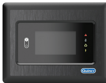
Q-Control Touch Controller