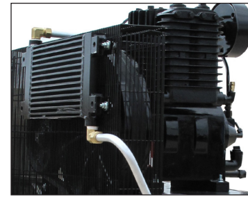
Air cooled after cooler Elite unit